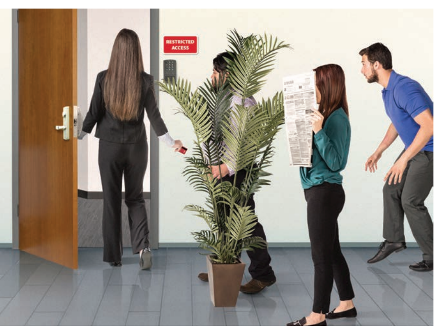
Your restricted access system may be giving tailgaters an "enter free" pass. Be sure no one is able to slip through undetected.

Detex puts dependable panic hardware in restricted secure areas - at birthing center entrances, pharmacies, surgical suites, and any other area where unauthorized entry must be controlled, and authorized entry must be easy, quick and reliable.