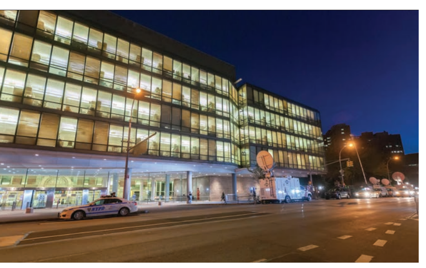
Since 2002, NYC Health + Hospitals/Bellevue has relied solely on Marks USA products for their door-locking needs. Shown below, an array of Marks Healthcare Solutions including LifeSaver™ Anti-Ligature Locksets and PD-Series Hospital Push/Pull locksets.

Healthcare and hospital safety and security present unique challenges; trying to strike a careful balance between securing the facility, safety needs of patients & employees, and providing a welcoming open campus environment. Protecting these facilities has become increasingly challenging for facility and security directors, with a growing list of threats ranging from infant abductions, active shooter situations, sentinel events; to risks of vandalism, violence or theft.