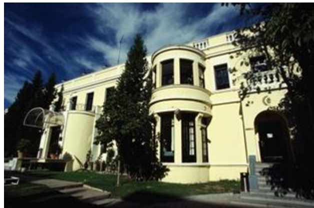
IE Business School, Madrid

ASIS International will once again partner with Madrid-based IE Business School, one of Europe's leading business educational institutes, to deliver Effective Management for Security Professionals. This four-day, executive education program has been customized to introduce mid-to-senior level security practitioners to the dynamics of business fundamentals.