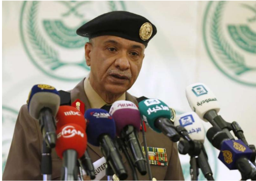
Saudi Interior Ministry spokesman, Major General Mansour Al-Turki.

Saudi security succeeded in thwarting an ISIS terrorist network consisting of three cluster cells linked to an information mediator in Syria. Uncovering the network has foiled a terrorist plan targeting citizens, scholars, security staff, military, and economic facilities in different Saudi locations. The Saudi Interior Ministry said the terrorist cell has been active in the preparation and processing of explosive belts and explosive devices to be used in their criminal operations.