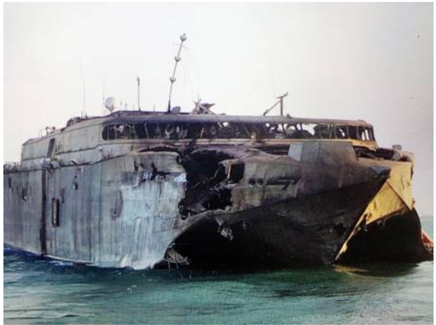
The UAE aid ship Swift was attacked in the Bab Al Mandab strait off the coast of Yemen.

Arab coalition forces have launched operations against militia boats of Yemen's Iran-backed Al Houthi group that struck a civilian logistics ship on a humanitarian voyage in a strategic Red Sea shipping lane, the Saudi-led alliance said. The vessel, an Australian-built, high-speed logistics catamaran under lease to the United Arab Emirates military, was attacked by Al Houthi fighters near the Bab Al Mandab strait off Yemen's southern coast on Saturday. The coalition rescued its civilian passengers. No crew were hurt.