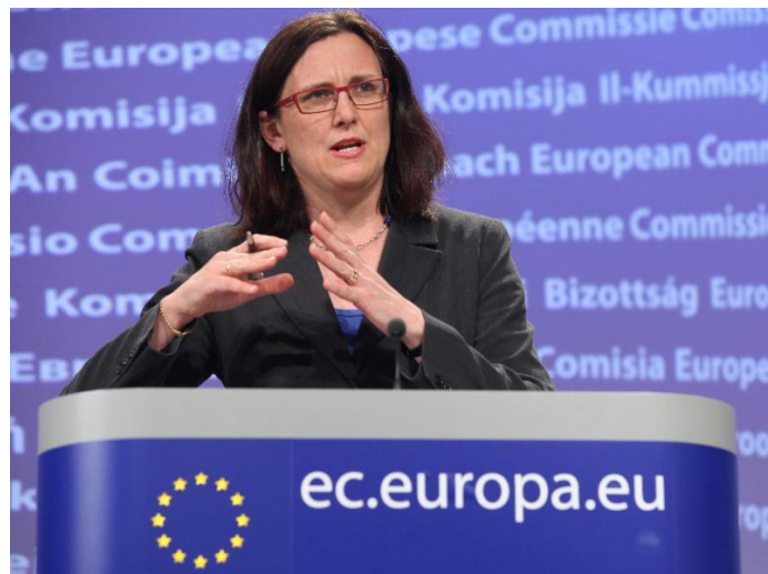
Cecilia Malmström, European commissioner for home affairs. The Directorate General for Home Affairs conducted the preparatory work for a communication on a new EU approach to the detection and mitigation of CBRN-E risks that was released on 5 May.