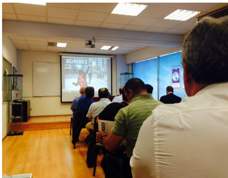
Attendees during one of the presentations at the seminar.