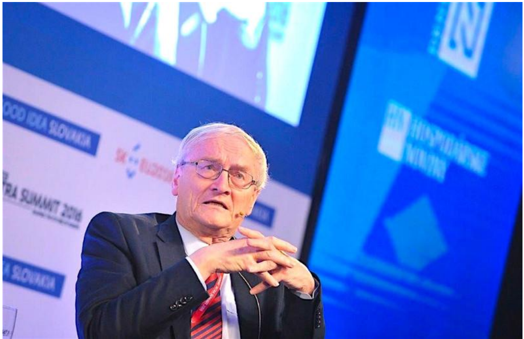
August Hanning the former head of Germany's BND intelligence services

A comprehensive 2016 calendar is available here . Register early and save by taking advantage of early-bird rates for ASIS educational programmes.