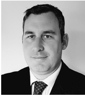
Head of Security Louvre Museum Abu Dhabi

El Manual del Investigador Profesional ya está disponible en español