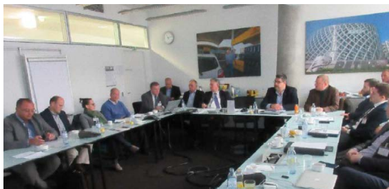
20 members and guests attended.