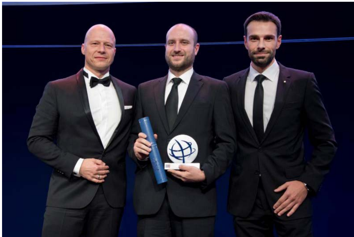
German OSPAs 2017