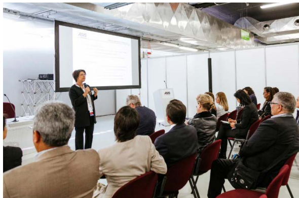
WIS session in the Career Centre.