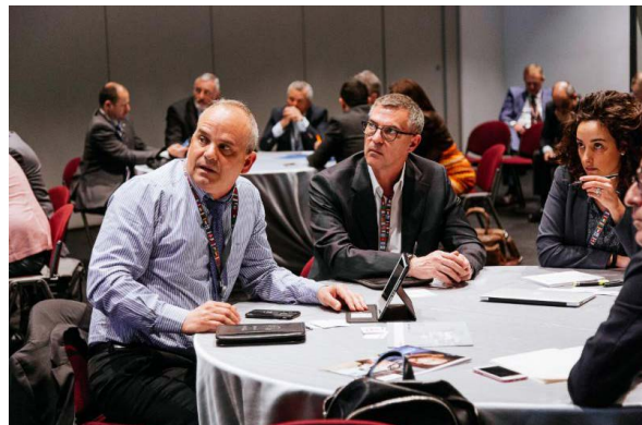
Workshops offered a new learning format.