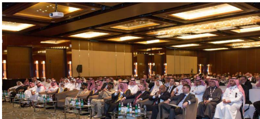
A plenary session at ASIS Middle East 2016.