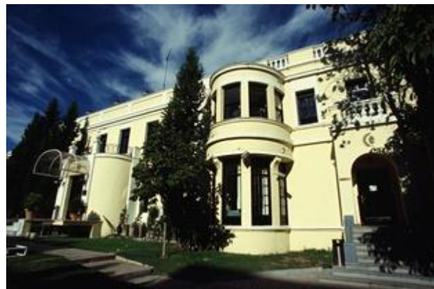
IE Business School, Madrid

ASIS International will once again partner with Madrid-based IE Business School, one of Europe's leading business educational institutes, to deliver Effective Management for Security Professionals. This four-day, executive education program has been customized to introduce mid-to-senior level security practitioners to the dynamics of business fundamentals.