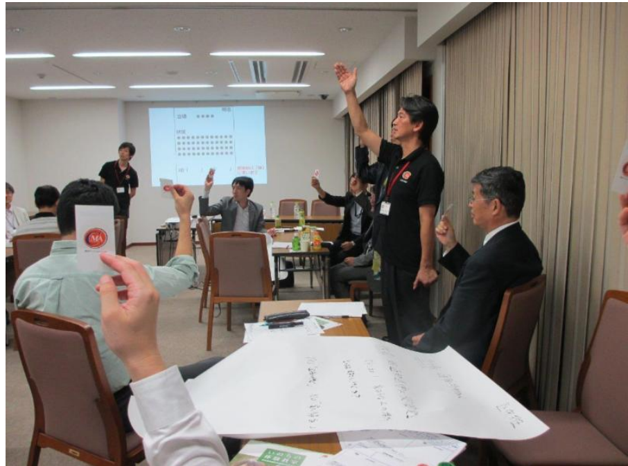
A similar Japan Chapter workshop held several years ago.

The Japan Chapter will hold a two-day workshop on July 8 and 9 in Tokyo on threat-based and proactive security management.