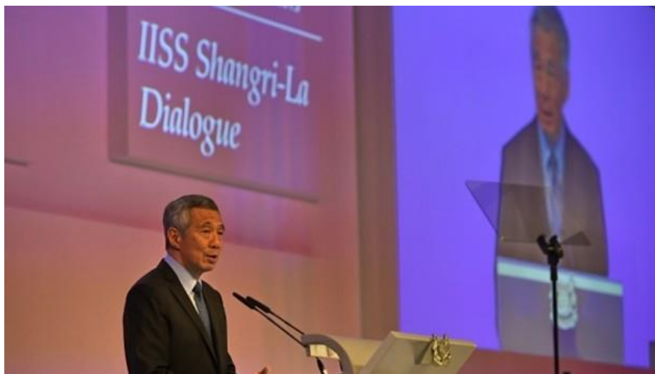
Singapore's Prime Minister Lee Hsien Loong.

The Islamic State in Iraq and Syria has ramped up its activities in Southeast Asia so effectively that there is now an entire military unit of terrorists recruited from Indonesia, Malaysia, and Singapore, according to Singapore's prime minister.