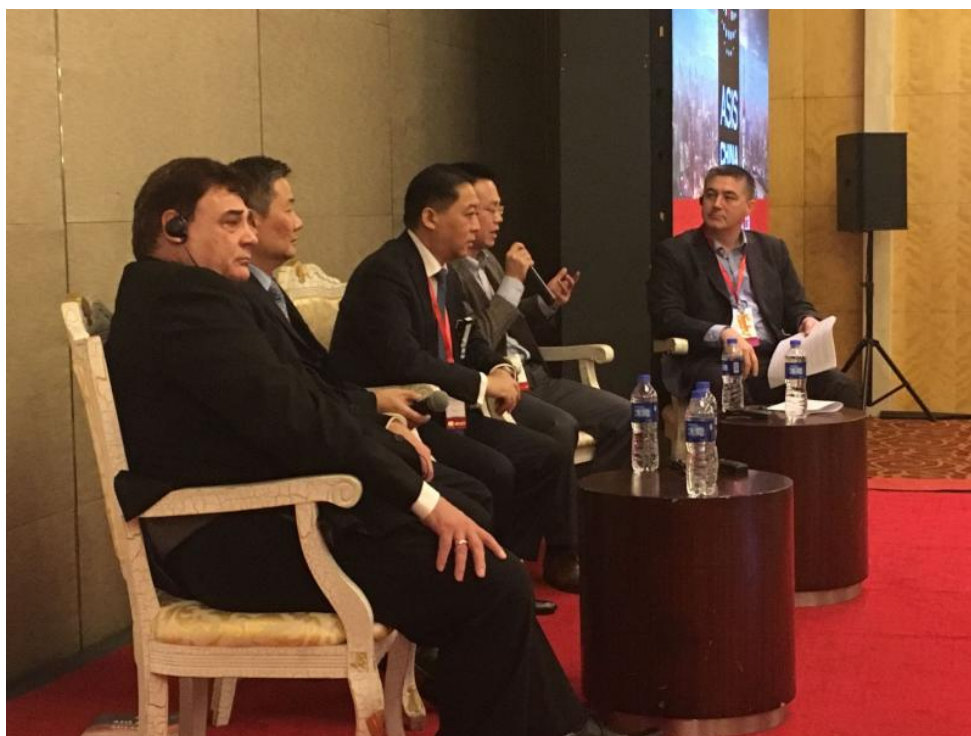
Panel debate on low margins in the guarding sector.