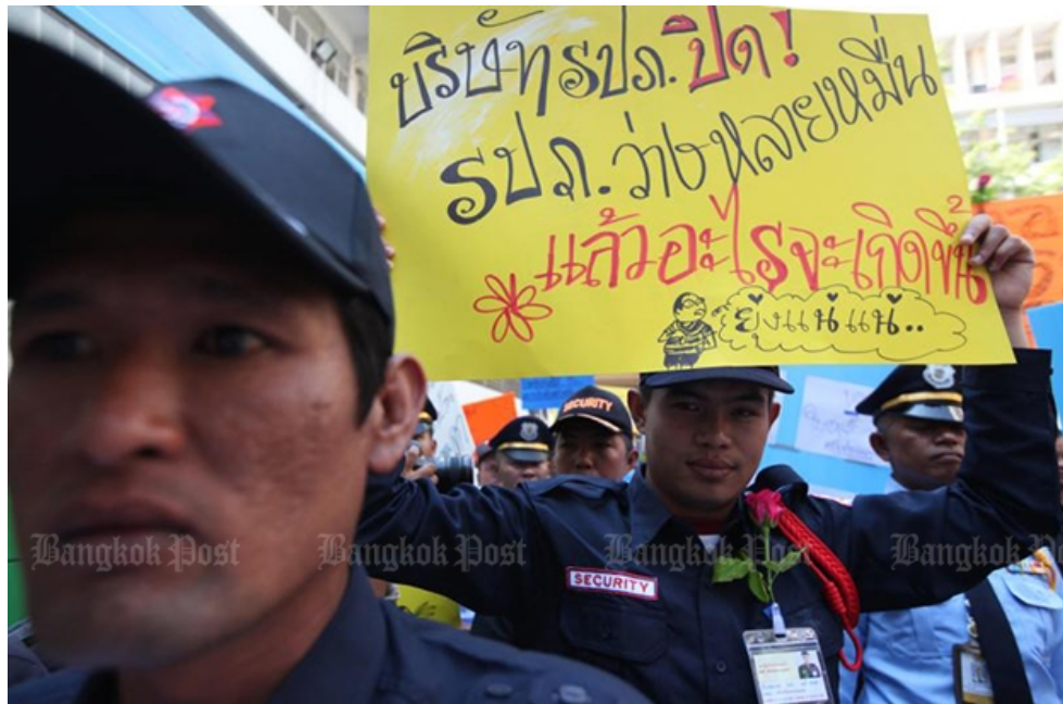
Security guards march to Government House in January asking the government to delay implementation of the Security Guard Business Act.

Thai Prime Minister Prayut Chan-o-cha has softened the minimum education requirement of Matthayom 3 for security guards.