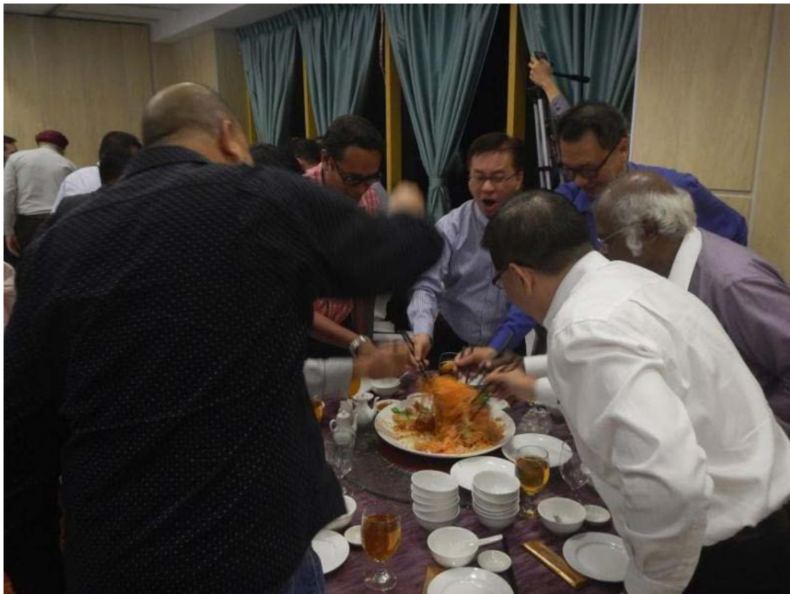
Tossing the Lo Hei and wishing all good health, happiness, and prosperity. Huat Ah!