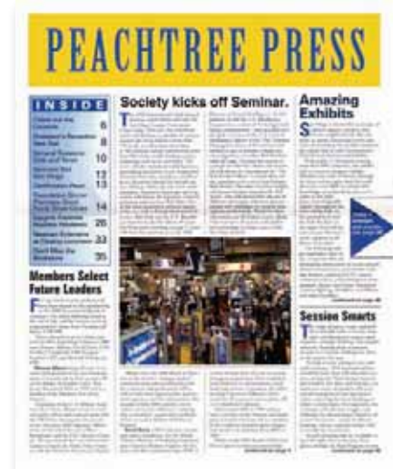
Exhibit Guide Rates

Open only to Show Newspaper advertisers. No charge for 4C or 2C.