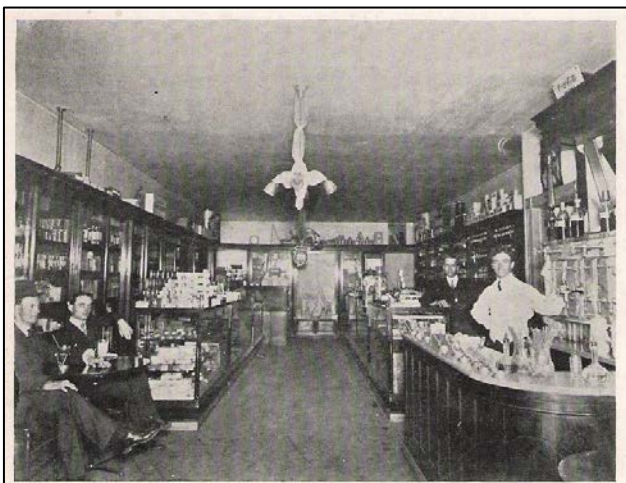
Interior of A. E. Lathrop's Drug Store