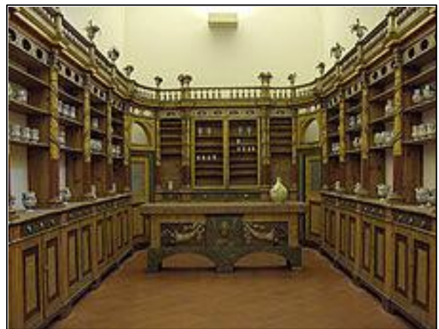
19th century Italian pharmacy