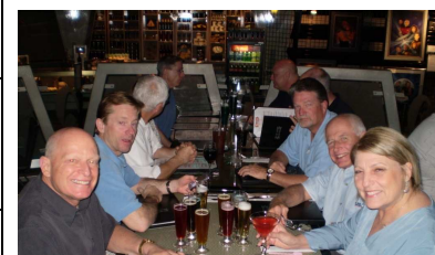
Council members in Vegas