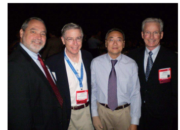
Council members & speakers