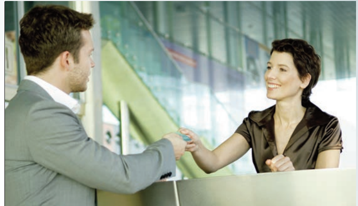
HID Global, the trusted leader in solutions related to the creation, use, and management of secure identities serving a variety of markets.

essential to ensuring children resume living their lives to the greatest potential. They strive to keep families fully informed, directly involved and as close to the child as possible. Connecticut Children's issues badges to 2,200 visitors a day, as well as 50 to 100 vendors, using EasyLobby® Secure Visitor Management Software by HID Global. The system enables Connecticut Children's to intake visitors with a quick scan of a driver's license, business card, or other common form of ID. In addition, the software integrates with the hospital's existing peripheral barcode scanners and digital cameras.